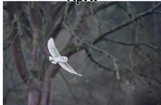
Barn owl in flight